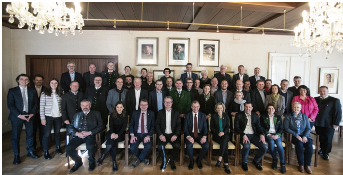
The picture shows the regional, political and cultural capacity of SKGT24.

We have grouped the answers to these 2 criteria together to demonstrate the synergy and connections between them.