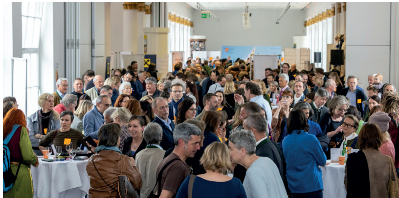
Marketplace of Ideas

The majority of projects presented in the Bidbook is already in contract preparation or in contract. About two thirds of the projects in the Bidbook could be further pursued. The other third of projects could not be pursued for different reasons. Reasons for withdrawal include project initiators who have withdrawn the project for personal or professional reasons, no follow-up of own projects, which could be replaced by more relevant new projects or no agreement with project initiators regarding legal or financial questions of the implementation.