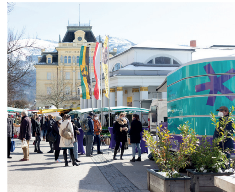
Communication Tour

Finally, we could secure support from a number of important personalities from arts and culture, who have a connection to our region, but are known far beyond the Salzkammergut, and help us to support and spread our ECoC idea and philosophy. This committee was invited by the Artistic Director.