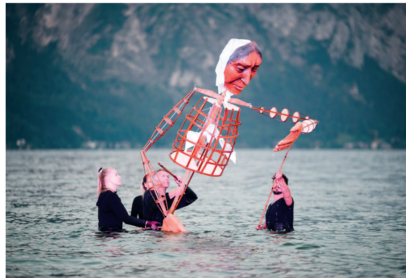
Libertalia Performance, © Edwin Husic