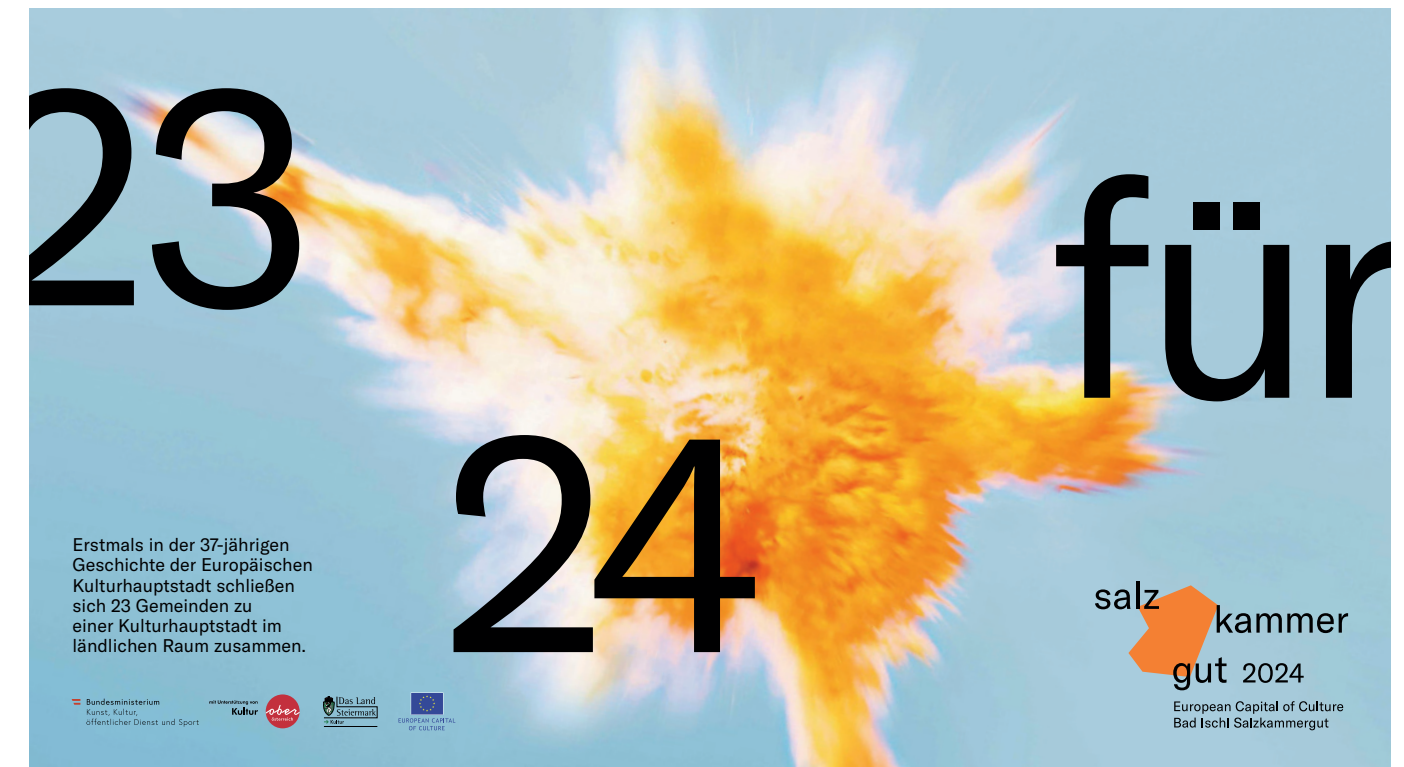
First advertising campaign „23 for 24“ – signaling 23 municipalities getting ready for 2024

In our programme we negotiate essential questions for the future - with ecological and cultural sustainability we want to help shaping a Europe of the regions that connects across borders through art and culture. Thereby we want to contribute to the question of how to live locally in rural areas and think (and often work) globally.