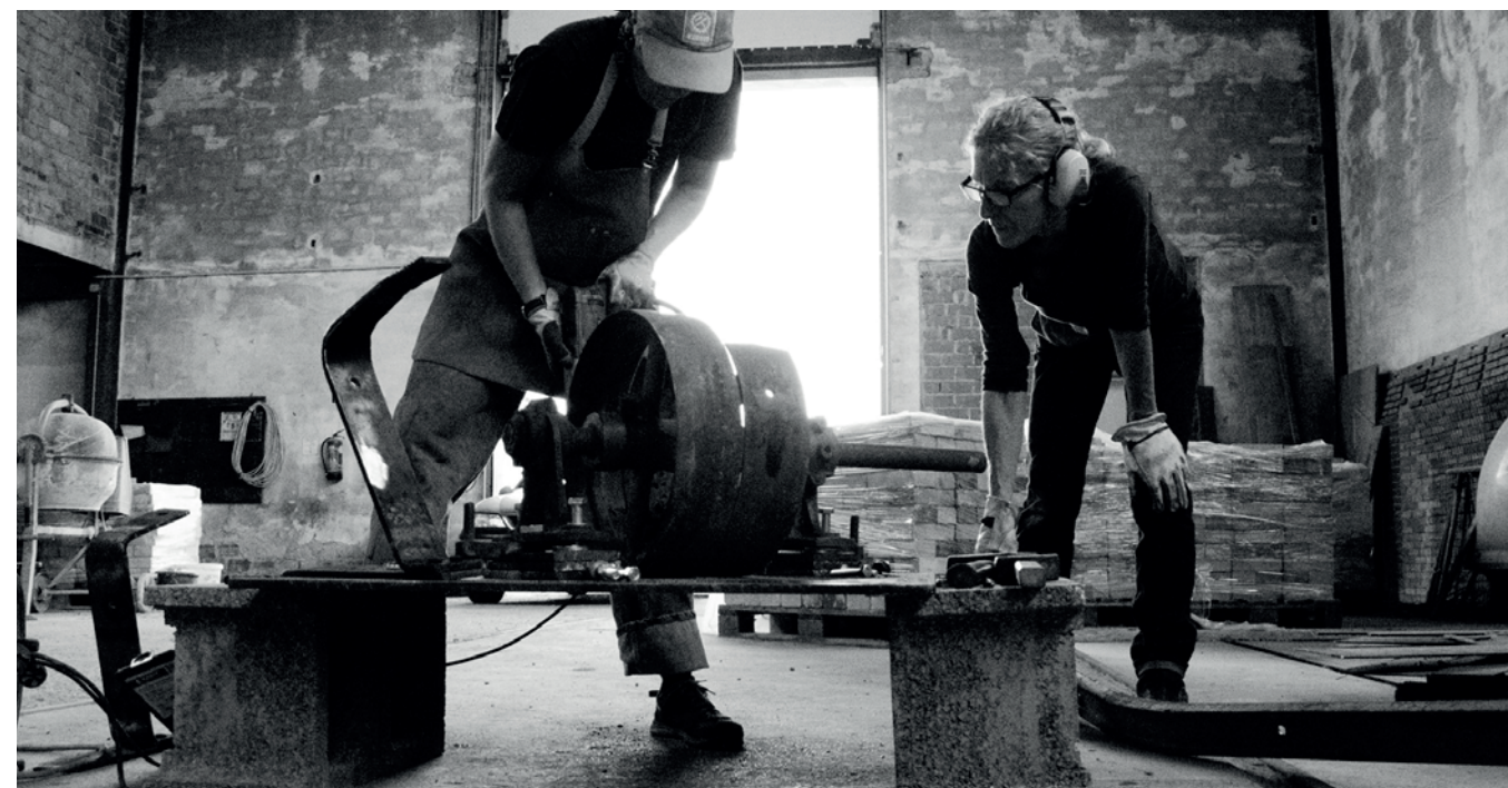
Salzkammergut Craft Art Lab

The School of Art and Craft as presented in the Bidbook is coming to life in the form of the Salzkammergut Craft Art Lab (SCALA), based in Bad Goisern. It creates a common space for experimentation, which at the same time is a platform for cooperation with other cultural institutions and businesses in the region as well as universities and international partners. While anchored in Bad Goisern, we aim to strengthen the craft network across the region (e.g. with ceramics in Gmunden, paper in Laakirchen, etc.).