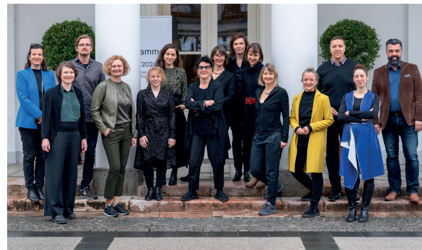
Team

A key priority for Gmunden is the development of a derelict inner-city industrial site, the KunstQuartier (Art Quarter). For this, a design study as well as an implementation, utilisation and financing concept are currently being developed. The KunstQuartier offers a multitude of possibilities. The Kunst-Quartier Gmunden will be an exhibition, workshop, event and recreation space, available for the title year of 2024.