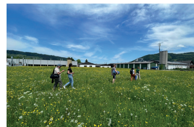
Looking for free spaces (project: Points of View), © Bernhard Mayer

Not only did we find beautiful forgotten places, most of the small train stations in our region are inactive due to technological transformation. Train stations are also a good symbol of our tourism approach: travel, in a sustainable way, stop and take some time for culture. Most of them are not considered attractive for common or conventional development. This is why we plan to direct the spotlight on these places by using them for our programme, such as Artist in Residency projects, co-working spaces and little presentations - and thereby turn them into spaces for cultural experience, creating a culture mile through the Salzkammergut. This approach includes also