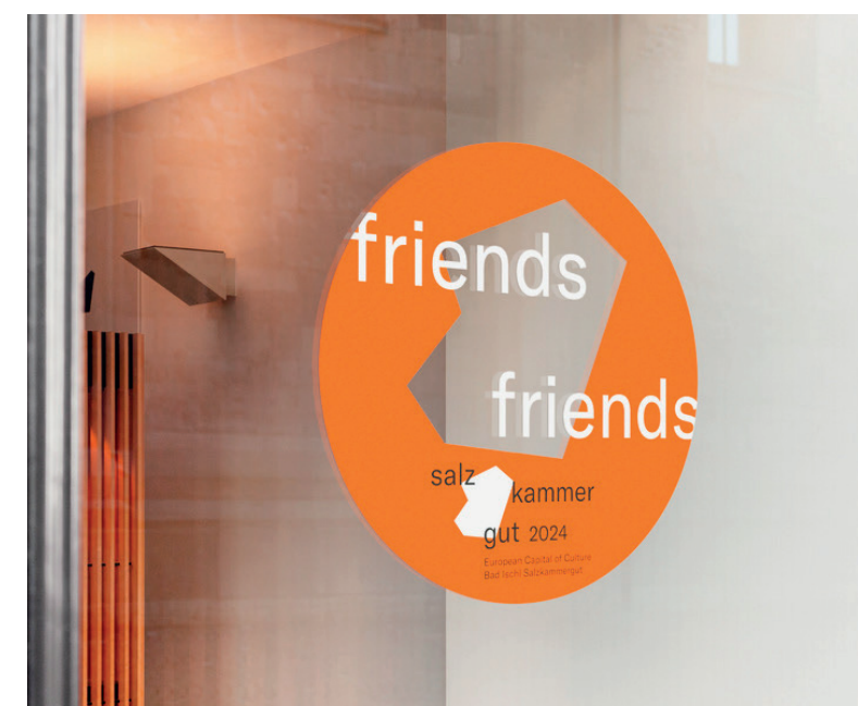
It's good to have friends