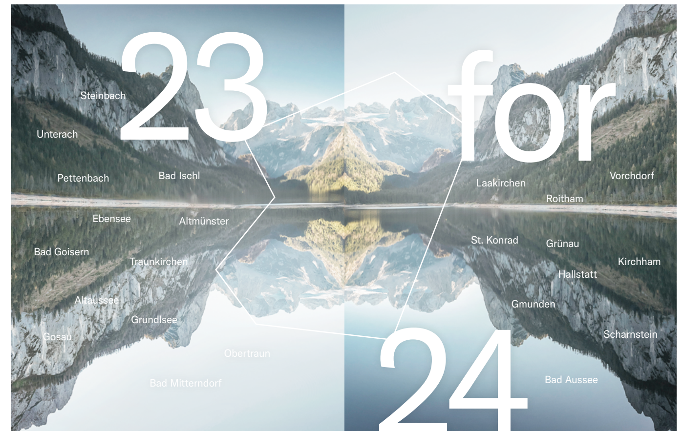
"23 for 24"

salzkammergut-2024.at facebook.com/salzkammergut2024 Instagram.com/salzkammergut.2024