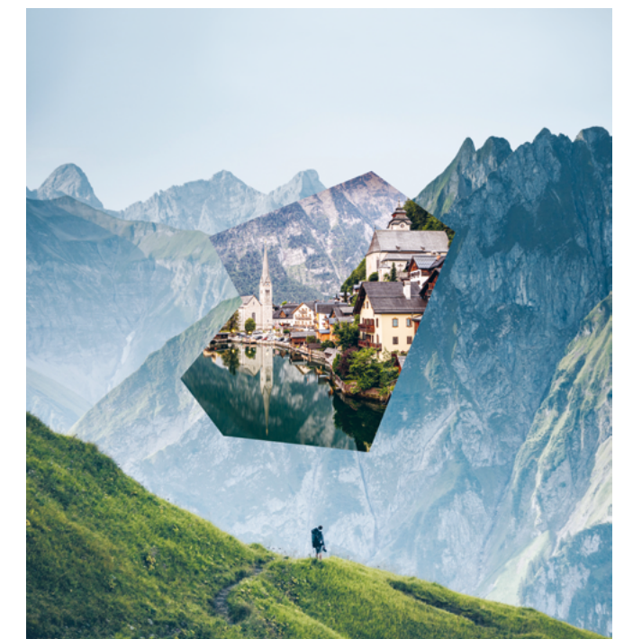
Sharing Salzkammergut – the Art of Travelling

Overall we do believe that we and our partners have worked in a joined-up way establish a sustainable model of cultural tourism, using our natural resources for very special events and experiences, improving public transport and delivering the possibility of more sustainable tourism and a lasting cultural infrastructure. More detail on how our broader communications strategy and our plans for sustainable tourism intersect is shown in the Management chapter.