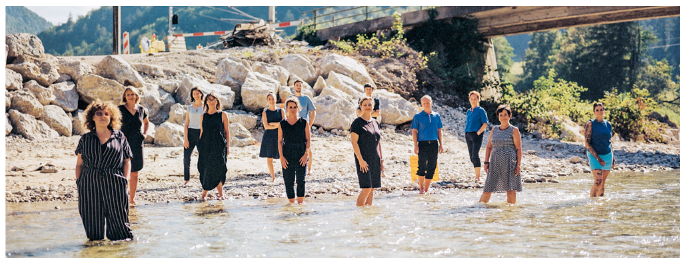
Team of Bad Ischl Salzkammergut 2024