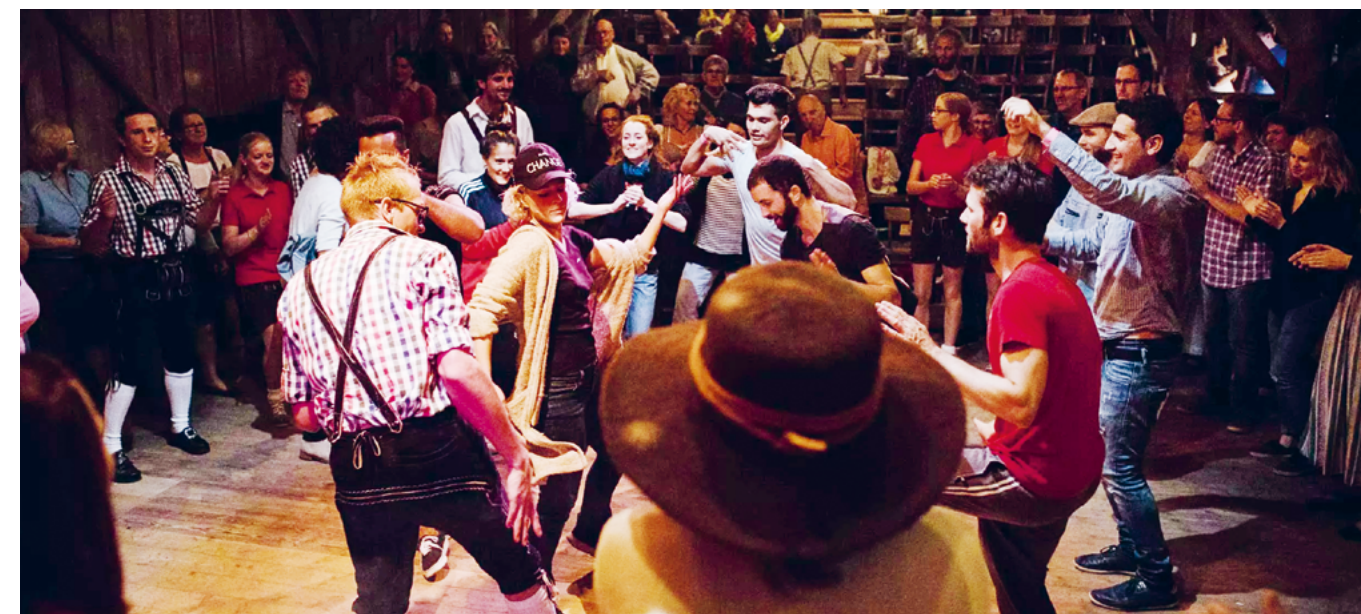
Folk Fest

We carried out this audit of vacancies to help us organise cultural events in unusual places (e.g. industrial sites, quarries, mountain huts, a school garden, platforms and boats on water, the ice cave of the Dachstein glacier,...). We found that many train stations are left empty in our region. And yet, they are the first places visitors and tourists see when coming here. Thus, the A.I.R. programme Salt Lake Cities was further developed to allow international artists to work in the vacant train stations.