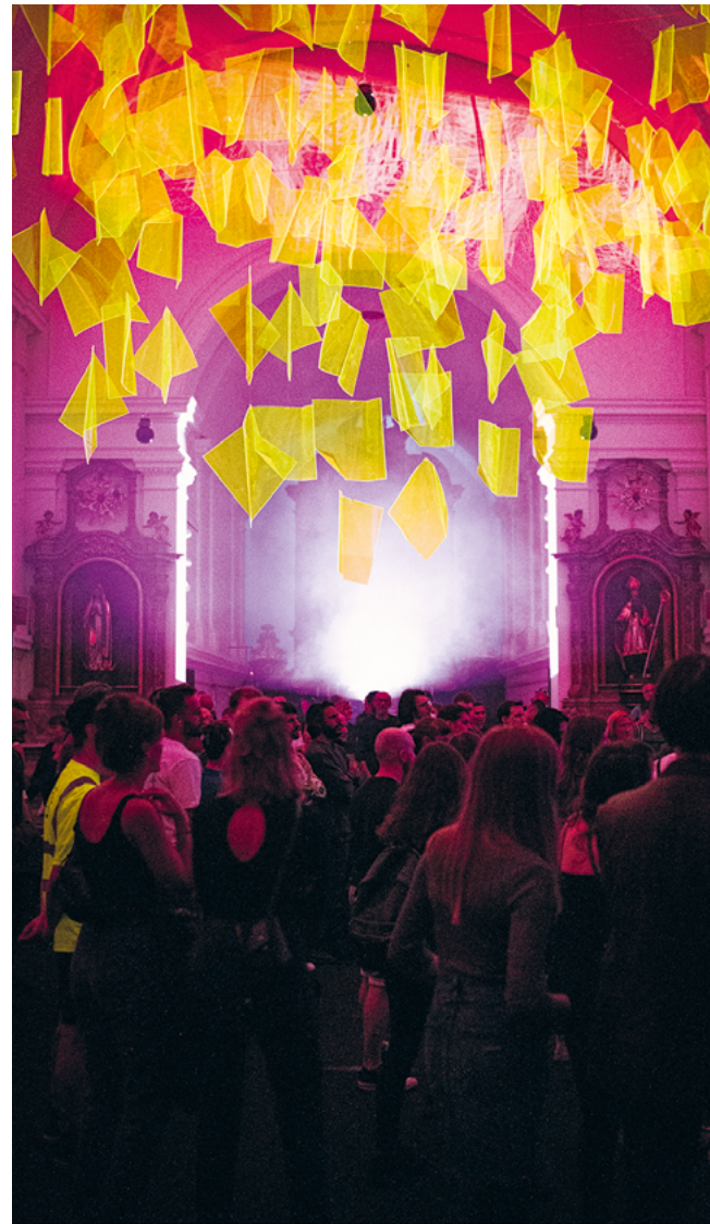
Holy Hydra © Fabian Erblehner

We have also added the project Alzheimer’s Holiday by MAS Alzheimerhilfe (Alzheimer’s Aid) in Bad Ischl to our programme as an Associated Project. At MAS Alzheimerhilfe, people affected by Alzheimer and their relatives can spend their holidays together and participate in various activities. Openly accessible events, but specifically addressed to people participating in this project, are planned in the Garden of the Healing Powers , focusing on herbal knowledge and garden art.