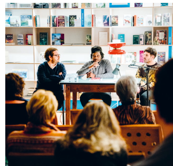
Deconfining Reading

We were also able to implement the Fête de la Musique in all 23 municipalities: a day without traffic in rural areas but with music taking over public spaces was already tested this year in some municipalities and will take place next year throughout Upper Austria. Furthermore, the exhibition Toourism by