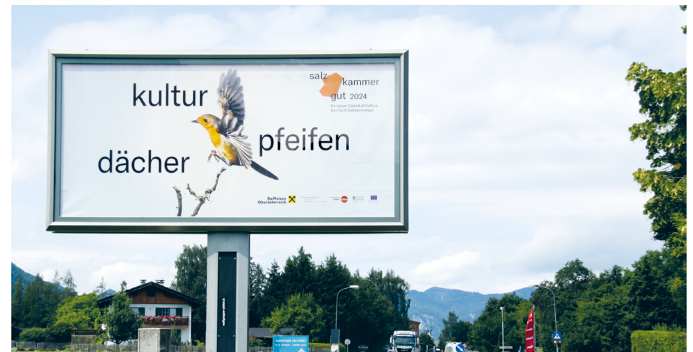
Billboard advertising in the region

Any interference in the artistic field is explicitly forbidden and excluded by the Rules of Procedure of the Controlling Advisory Board and according to our funding agreements with the Federal and State Governments. The European Capital of Culture is supported by the public administration both at the municipal level (in preparing and implementing events) and at State and Federal State level (in networking and specialist questions).