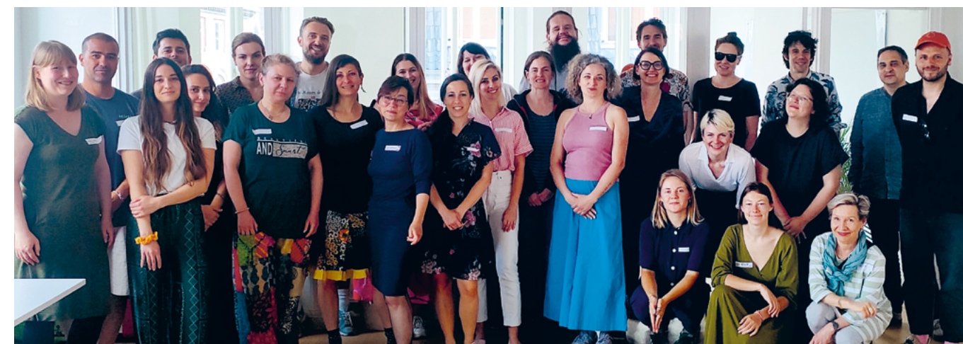
The Big Green: Networking Event with 25 European Partners

The project Silent Echoes: Dachstein of connecting the ice caves of the Dachstein glacier to Notre-Dame de Paris was already mentioned. The European Theatre Festival Bad Ischl (supported by the European theatre network mitos21, with theatres from – among others – Germany, Sweden, Italy and Belgium) aims at creating a dialogue between local young and upcoming artists and the international theatre scene. The project probably The Best Hotel in the World proposes a solution to the problems of hyper tourism; it is made of air and sound –