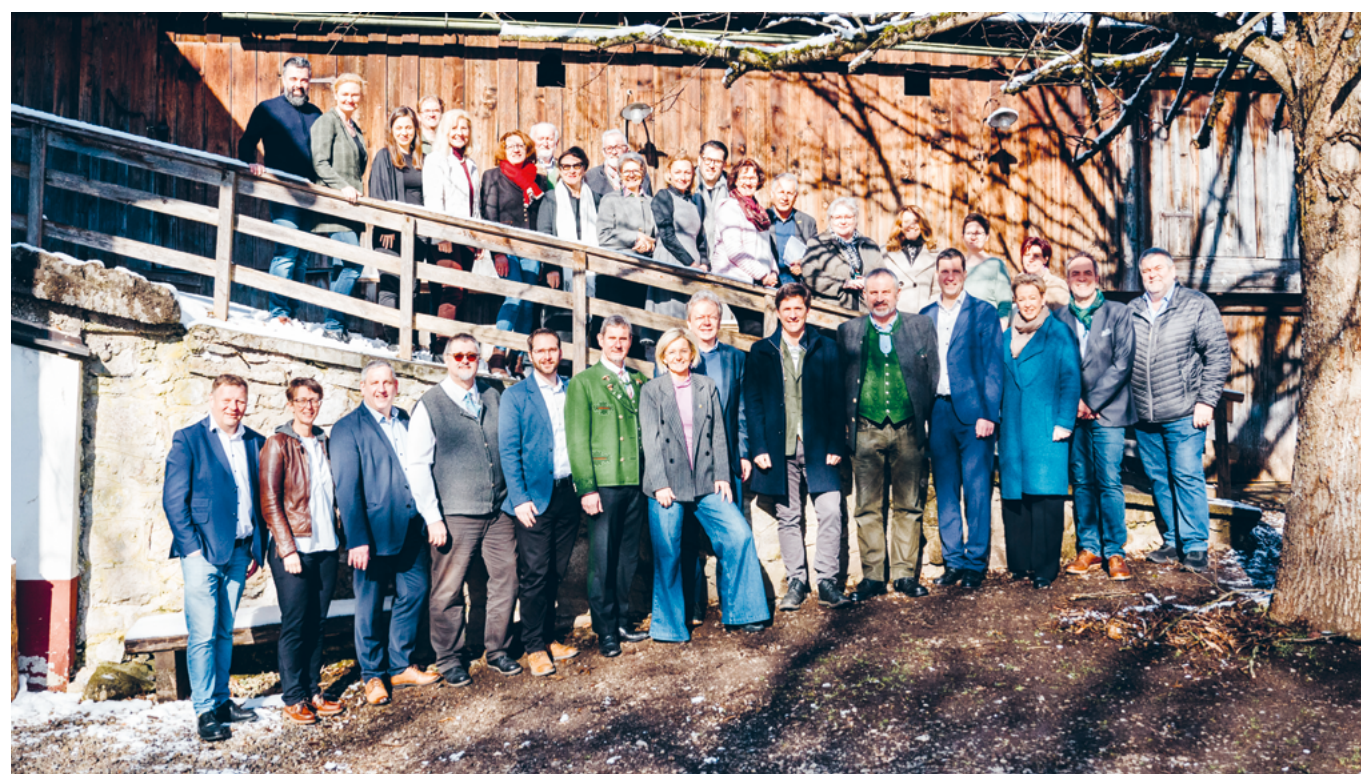
23 for 24

Since Winter 2022/23, we focussed our Social Media strategy on "Preparing Salzkammergut". The programme development and preparatory work is rapidly progressing and the first artists are completing residencies and research work in the region. Thus, our Social Media team is already producing and publishing related content in the form of short videos (reels), stories and photo albums. A focus lies on being active on Facebook and Instagram. YouTube is used as a platform for live streams of our press events. On LinkedIn, only selected