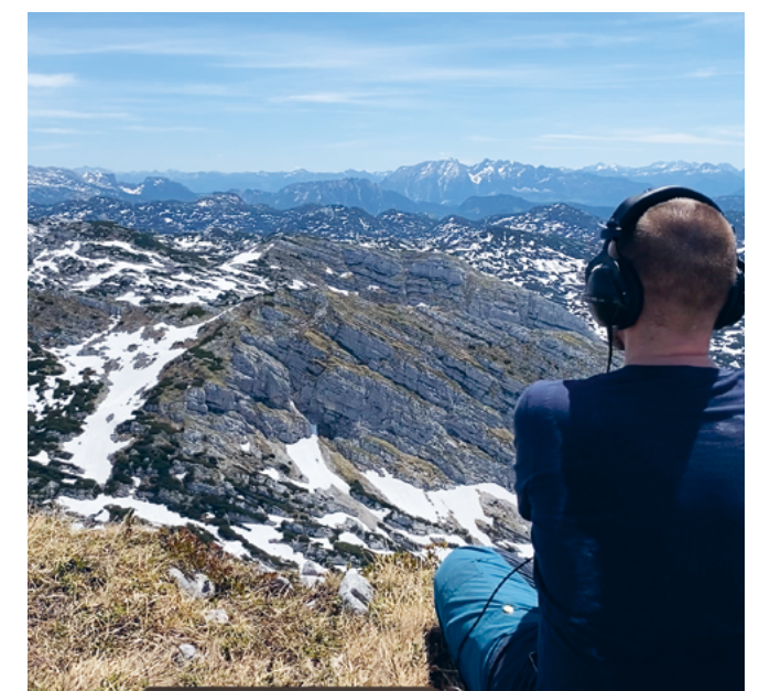
The Great Space Walk

In all the focal points mentioned above, the European Dimension applies, but also a global one: Europe can no longer view itself in a centralist way, but needs to reposition itself to a new geopolitical balance of powers – coming to terms with history and the sustainable use of natural and cultural resources. This is for example exemplified in the wide-ranging African-European cooperation project Deconfining arts, culture and policies in Europe and Africa .